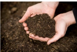
Green waste, compost heaps and the final compost product